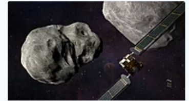
Artist's impression of the DART mission approaching Dimorphos