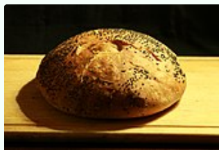
Loaf of bread baked with Carl Griffith's sourdough starter