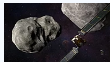
Artist's impression of the DART mission approaching Dimorphos

Redirection Test (DART) mission is launched to attempt to deflect the course of the asteroid Dimorphos ( illustrated ).